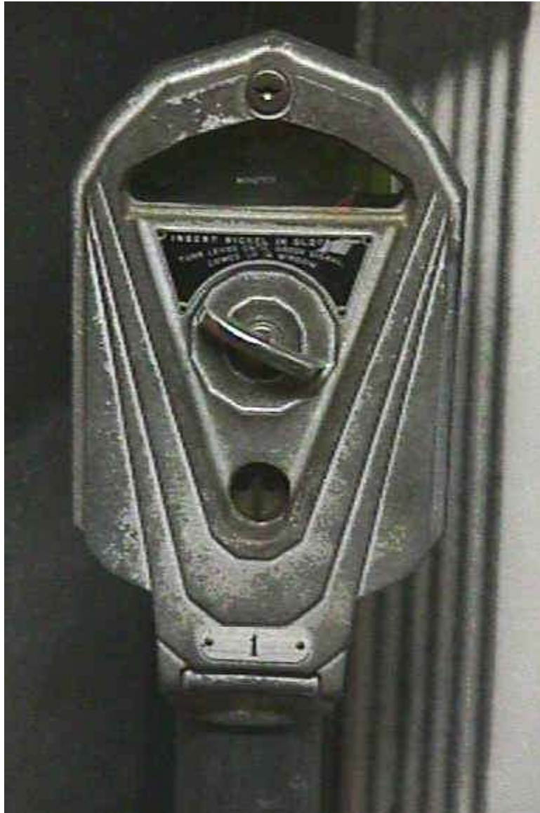
A: Oklahoma City , on July 16, 1935.